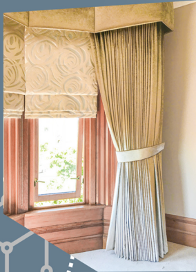
Image is everything and your guests deserve the best. One of our dedicated Sales Managers will visit your hotel and provide advice on space, design, products and services. Taking in your vision and feeding it back to our team of in-house designers.